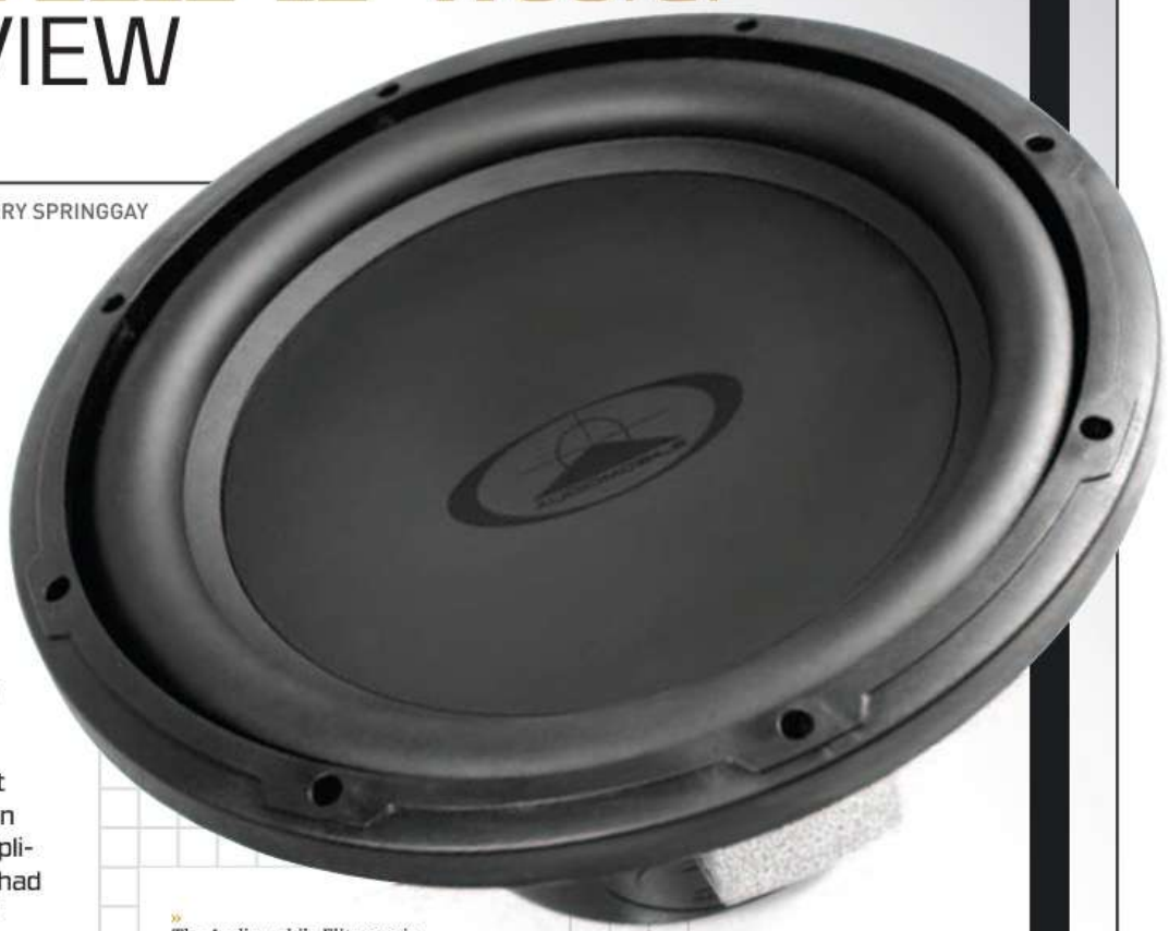
» The Audiomobile Elite 2212 is designed to work in either sealed or vented applications, with smaller than usual enclosure requirements.